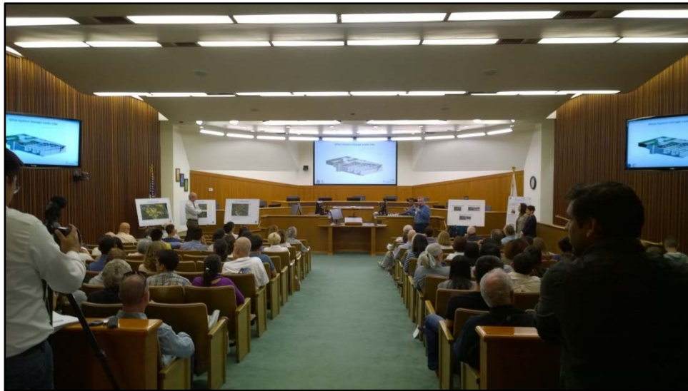
Attendees at the Thursday, August 25 Community Meeting

The Community Meetings utilized a combined open house and presentation format, with handouts (fact sheets, comment cards) and informative, interactive exhibit displays at multiple stations. During the open house, attendees were invited to view the exhibits and to discuss alternatives in detail with project team members. A formal presentation and a Q&A session provided attendees the platform to ask questions and comment on the proposed alternatives and were followed by a second open house interval. Light refreshments were provided.