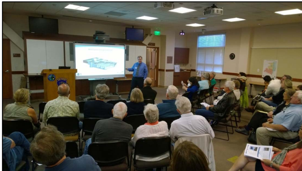
Attendees at the Tuesday, August 23 Community Meeting

On August 23, 2016 and August 25, 2016, the San Mateo Clean Water Program’s Basins 2 & 3 Collection System Improvement Project team facilitated the first of two rounds of Community Meetings in San Mateo to discuss the In-System Storage location alternatives and the selection process. The discussions provided an overview and update on the Clean Water Program, including a review of sanitary sewer overflows (SSOs), the City’s regulatory requirements (Regional Water Quality Control Board’s Cease and Desist Order and the National Pollutant Discharge Elimination System (NPDES) Permit, the criteria used to narrow down the list of site alternatives, the five storage alternatives, and the opportunities for public input. As the August meetings were the first in a series of opportunities to engage the public, the project team specifically sought public input to inform further selection among the five site alternatives currently under consideration.