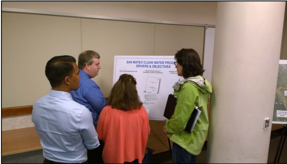
Attendees at the Tuesday, August 23 Community Meeting